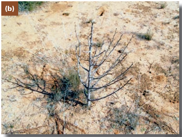
FIGURE 4: Native pines with: (a) little damage (score 1); or (b) complete defoliation (score 5).