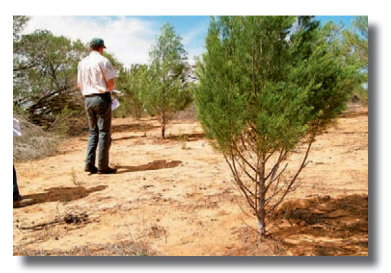
FIGURE 3: Absence of small seedlings and a distinct 'browse-line' 500 millimetres above the ground on older saplings indicates severe rabbit impact (Damage score = 5).

In some instances rabbits may have eaten all of the seedlings but the severity of grazing can still be ranked at '5' from the presence of a distinct 'browse-line' 500 millimetres above the ground on older saplings or mature shrubs with lower foliage within reach of the rabbits (see Figure 3 ).