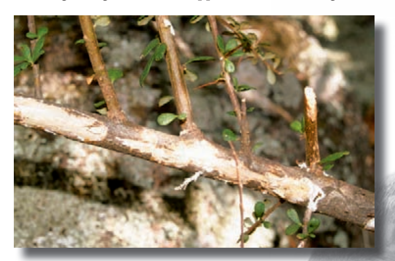
FIGURE 2: Rabbit damage showing stripping of bark and 45° 'secateurs-like' cuts through twigs.