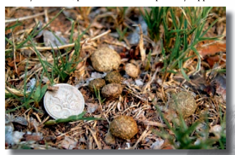
FIGURE 1: Typical small clump of rabbit pellets (faeces) in grassland.