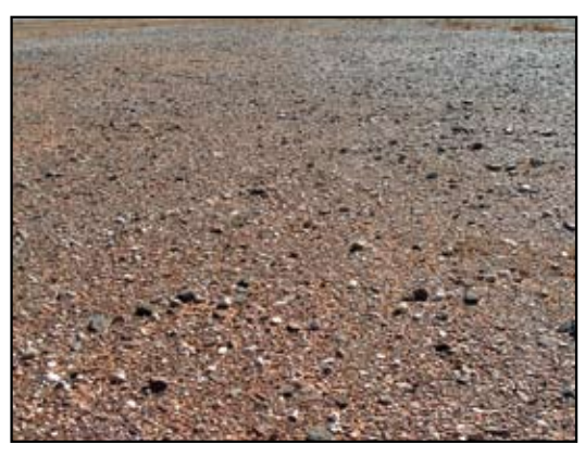
Poor tracking/scat collection habitat (arid zone), Elizabeth Denny