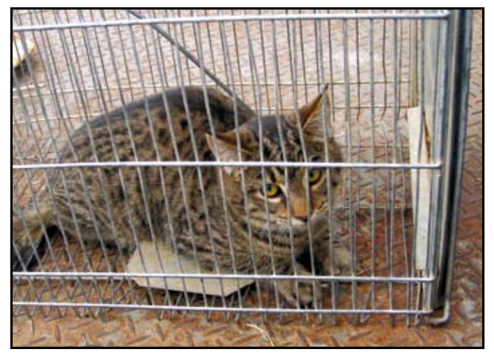
Cat captured in cage trap, Dan Hough