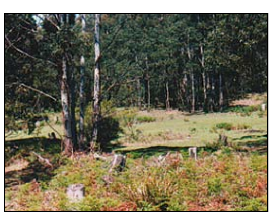
Poor tracking/scat collection habitat (forest), Elizabeth Denny