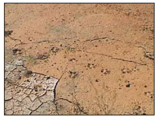
Cat tracks in mud