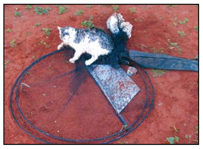
Cat captured in net trap, Dan Hough