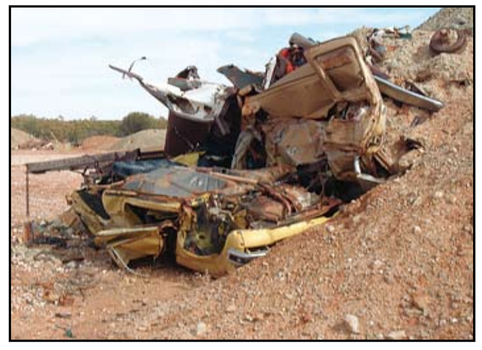
Resting/nesting area (arid tip site), Elizabeth Denny