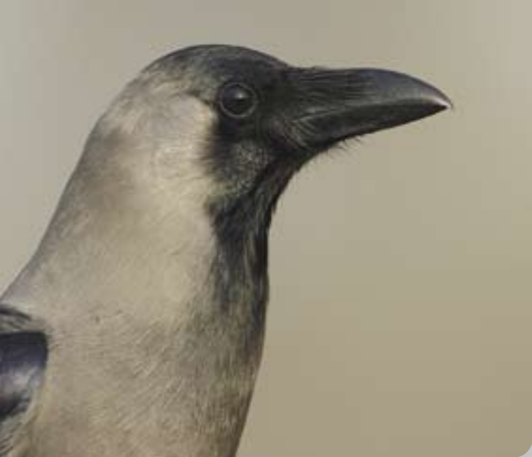
Figure 3. House Crow from Bangalore, India; note the pale neck contrasting with the darker forehead, crown, throat and wings.