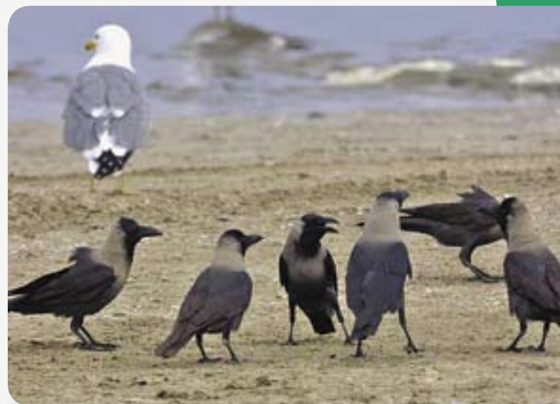
Figure 5. House Crows from an introduced population in Barka, Oman.

Many control programs overseas have attempted to eradicate the House Crow or lessen the damage it causes. Methods used include shooting and scaring with firearms, trapping, chemical repellents, poison baits and habitat modification. Other methods include destruction of nests and paid-bounties on crow eggs and chicks.