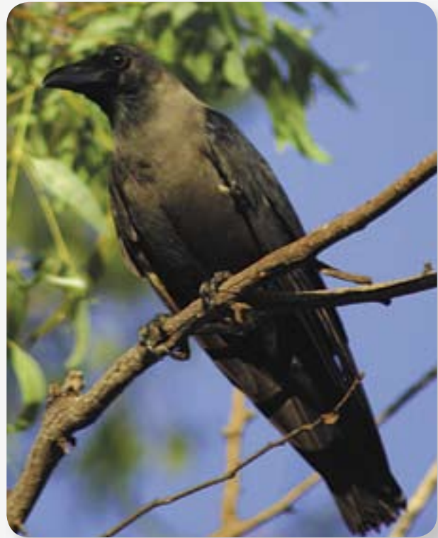
Figure 6. House Crow found in a Port Hedland caravan park (north-western Western Australia).

To help prevent the House Crow from establishing in the wild and becoming a pest in Australia, it is essential to immediately report all sightings to the nearest relevant government department or wildlife authority. Any House Crow reported can then be removed humanely.