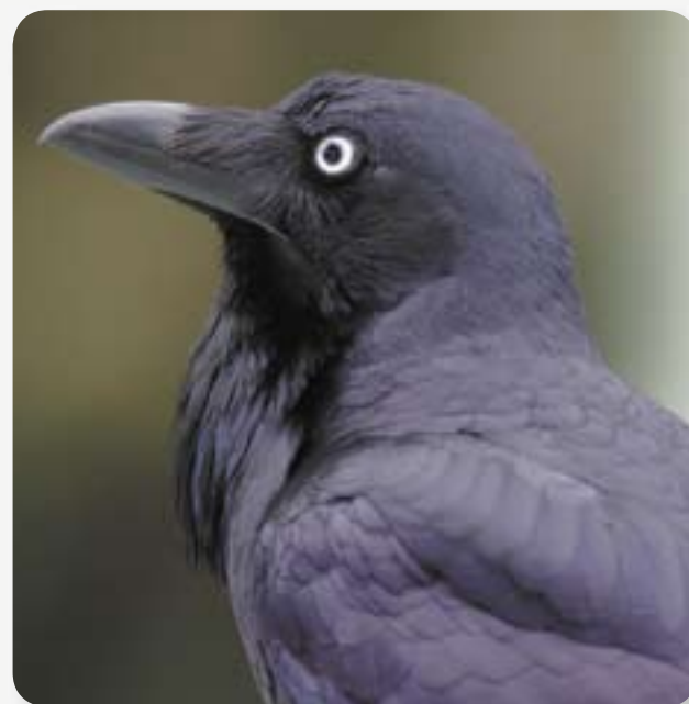
Figure 2. Adult Australian Raven.

Introduced populations also occur in Malaysia, Singapore, Hong Kong and the Netherlands.