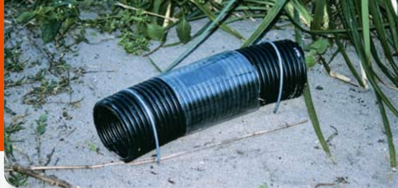
Figure 6. Bait stations stocked with toxic baits are used to remove Pacific, black and Norway rats from Australian, New Zealand and Pacific islands.

The Chief Executive Officer of the Department of Agriculture and Food and the State of Western Australia accept no liability whatsoever by reason of negligence or otherwise arising from the use or release of this information or any part of it.