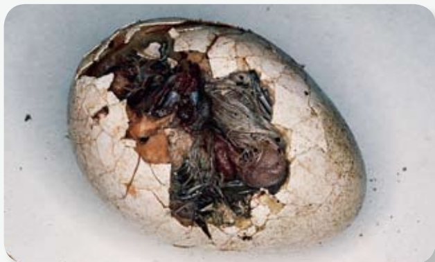
Figure 5. Pacific rat damage to an egg of the Kakapo (an endangered ground-nesting parrot in New Zealand).

Intensive eradication programs using toxic baits are used to remove Pacific rats from Australian, New Zealand and Pacific islands (Figure 6). In 2004, a program to eradicate rats from Adele Island was conducted by the state Department of Environment and Conservation and though it was unsuccessful, a follow up campaign is planned for 2011.