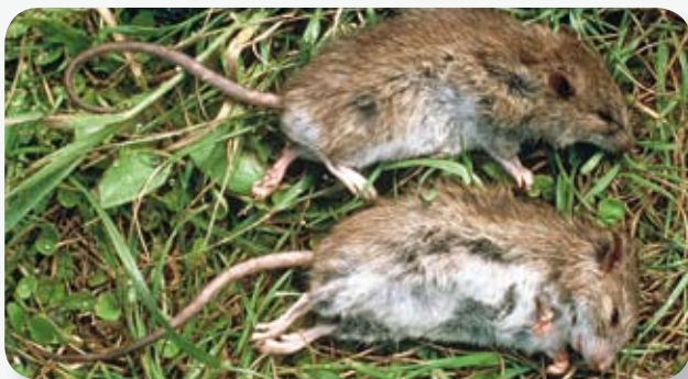
Figure 2. The body fur of the Pacific rat is reddish-brown to grey-brown and the belly fur is dark grey with pale tips.

The Pacific rat is a small mammal 8 to 14 cm in length (head and body) and 30 to 100 g in weight. The tail length is variable, often as long as or slightly longer than the body but it can also be shorter. The body fur is reddish-brown to grey-brown with translucent bristles buried in the fur and projecting black guard hairs on the back and sides; the fur feels somewhat harsh to touch. The belly fur is dark grey with white or pale grey tips (Figure 2). The thin, dark tail has short hairs on the upper surface and narrow rings of scales. The upper surface of each hind foot is marked with a triangle of dark reddish-brown hairs, extending from the ankle to part way down the foot. The toes are pale. The rat has a pointed nose and naked ears with dark grey skin.