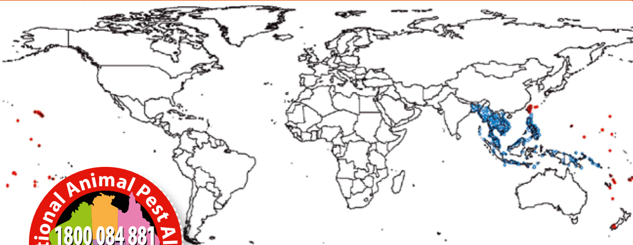
Figure 1. The distribution of the Pacific rat including natural (blue) and introduced (red) populations.