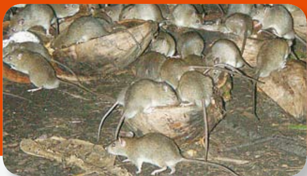
Figure 3. Pacific rats feeding on coconuts in an area of subsistence agriculture on Naqelevu Island (Fiji).