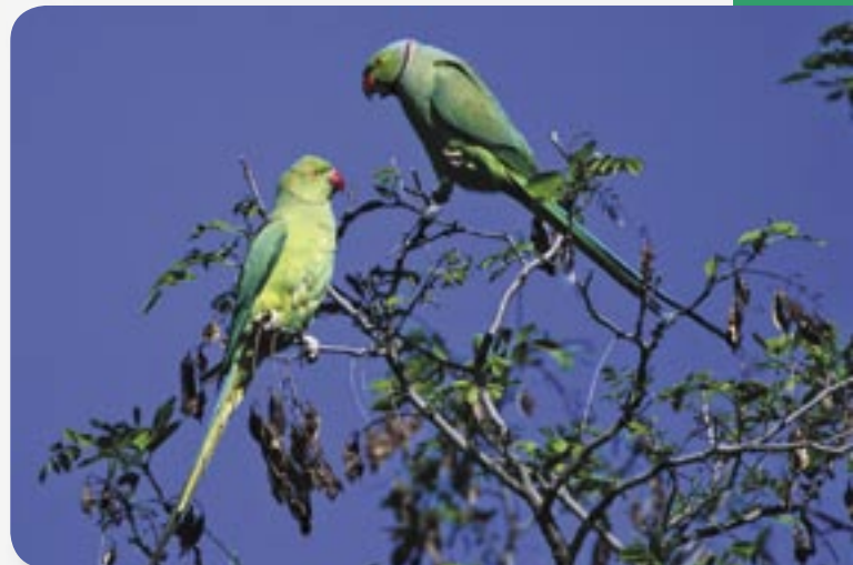
Figure 8. Indian Ringnecks established in the wild in Kern County, California.

Produced with support from the Australian Government's Natural Heritage Trust through the National Feral Animal Control Program. Endorsed nationally by the Vertebrate Pests Committee and relevant state and territory authorities. Technical information, maps and photos 5 to 7 provided and published by the Department of Agriculture and Food, Western Australia.