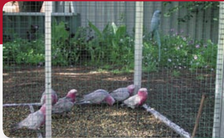
Figure 7. An escaped Indian Ringneck safely retrieved along with several Galahs.

The Chief Executive Officer of the Department of Agriculture and Food and the State of Western Australia accept no liability whatsoever by reason of negligence or otherwise arising from the use or release of this information or any part of it.