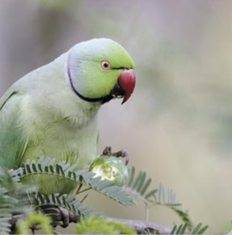
Figure 3. Male Indian Ringneck eating fruit.