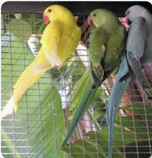
Figure 6. Indian Ringnecks that were part of a breeding group of six trapped in a Perth suburb.

Many Indian Ringnecks are caught using cage traps and relocated to the care of responsible bird keepers. Different colours, including blue, yellow, grey and white, have been bred in captivity and become common.