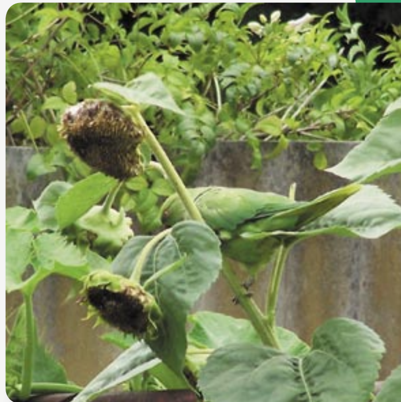
Figure 5. Spot the Indian Ringneck feeding on sunflowers in a Perth garden.

It is therefore important that birds found in the wild in Australia are removed quickly. Indian Ringnecks could threaten biodiversity here if they become established in the wild. Native parrots such as rosellas and the endangered Swift Parrot may be at risk from competition for nest hollows. Agricultural crops such as sunflowers, other oilseeds, grapes and other fruit could be at risk.