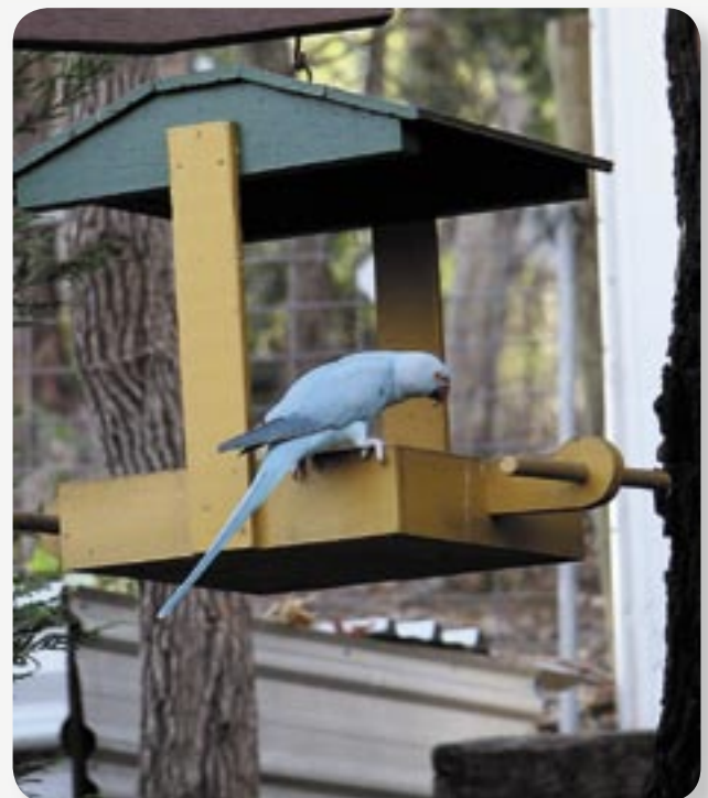
Figure 2. An escaped Indian Ringneck visiting a bird feeder in a fruit growing area near Perth.

In Western Australia escaped Indian Ringnecks are often attracted to bird feeders containing seed or fruit put out for other species (Figure 2).