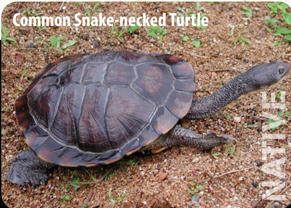
Common Snake-necked Turtle