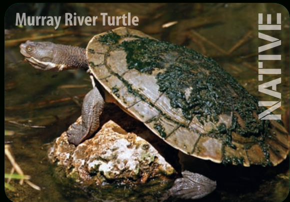
Murray River Turtle