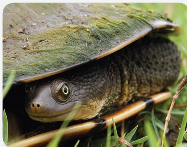
Figure 3. Native turtles fold their necks sideways into their shells if threatened.

neck sideways into the shell (Figure 3), whereas the Red-eared Slider retracts its head by pulling it straight back into the shell (Figure 4).