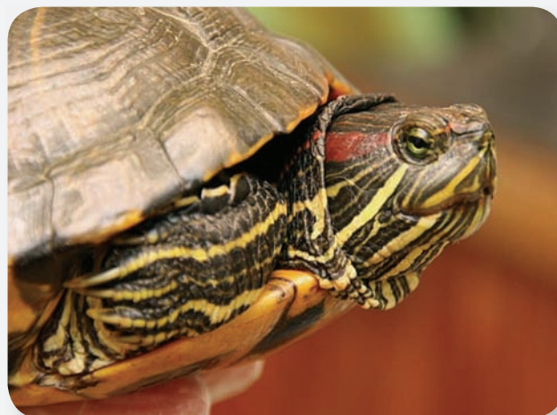
Figure 4. Red-eared Sliders pull their heads straight back into their shells if threatened.