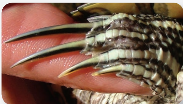
Figure 2. Male Red-eared Sliders have long claws on their front feet.

Some Australian freshwater turtles can be mistaken for sliders, but there are some important differences. Slider carapaces are dome-shaped whereas those of native turtles are fairly flat. In addition, native turtles do not have the long claws typical of male Red-eared Sliders (Figure 2). When threatened, a native turtle retracts its head by folding its