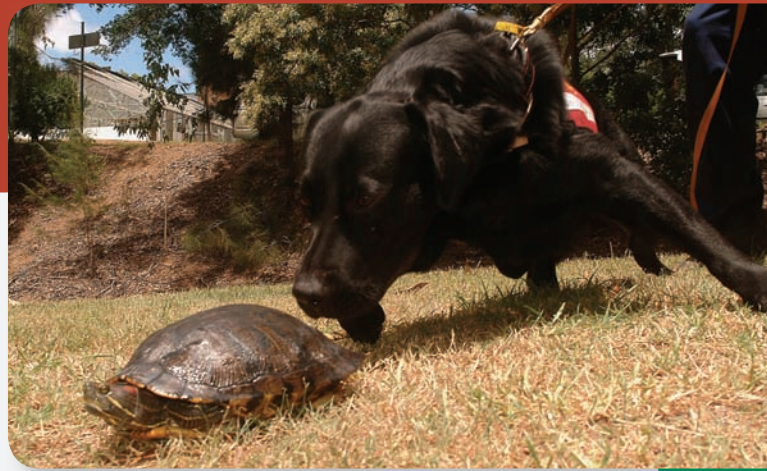
Figure 6. Surveillance activities are carried out in some areas to locate sliders in the wild. Angus the sniffer dog has been trained to locate sliders and their buried eggs.

The Chief Executive Officer of the Department of Agriculture and Food and the State of Western Australia accept no liability whatsoever by reason of negligence or otherwise arising from the use or release of this information or any part of it.