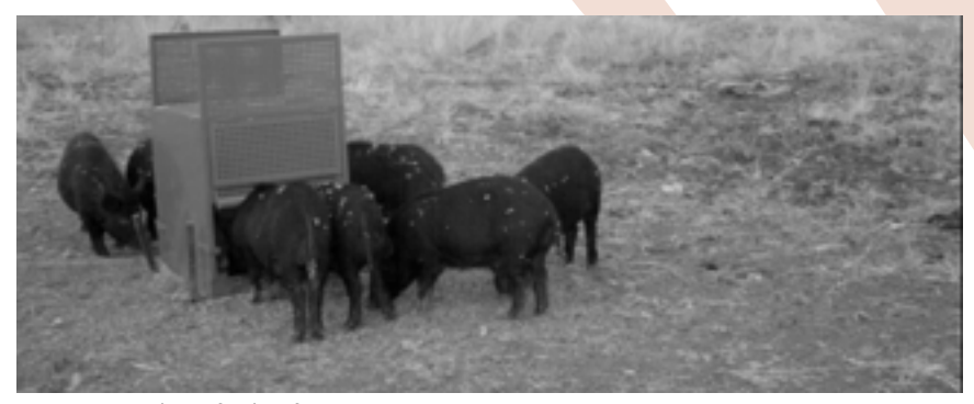
Figure 10: Feral pigs feeding from a HOGHOPPER®