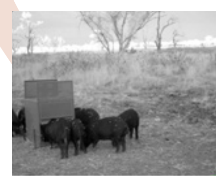
Figure 8: Camera monitoring shows that some pigs in the mob are still not confident to feed from the HOGHOPPER®, so a couple more days pre-feeding would be advised.

Once the site is cleared of pre-feed, place an equivalent amount of toxic bait at the station in a similar manner to how the pre-feed was laid (on the ground in trails, small piles or in HOGHOPPER®'s). Feral pigs are cautious animals and small changes may cause them to change their feeding behaviour.