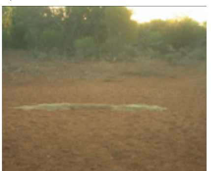
Figure 5: Example of feral pig bait station on regular travel pad between a day-camp and feeding area.

The pre-feed bait material should be a non-toxic version of the poison bait material you plan to use when you start poisoning, so the animals are accustomed to eating it. The bait should be laid in a trail (Fig. 5), or in several small plies, so that larger animals cannot dominate and eat all the bait. Bait can also be delivered using a HOGGOPPER®, which is a feral pig specific bait delivery device. Attractants such as Carasweet® or molasses may help encourage bait-uptake.