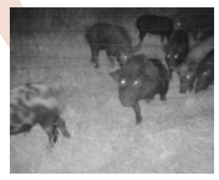
Figure 4: Feral pigs moving through a fence between dense habitat and a preferred feeding ground.

Spacing distances between stations will depend on a number of factors including resource abundance, topography, climatic conditions and feral pig home range size. A good starting point is >1km apart.