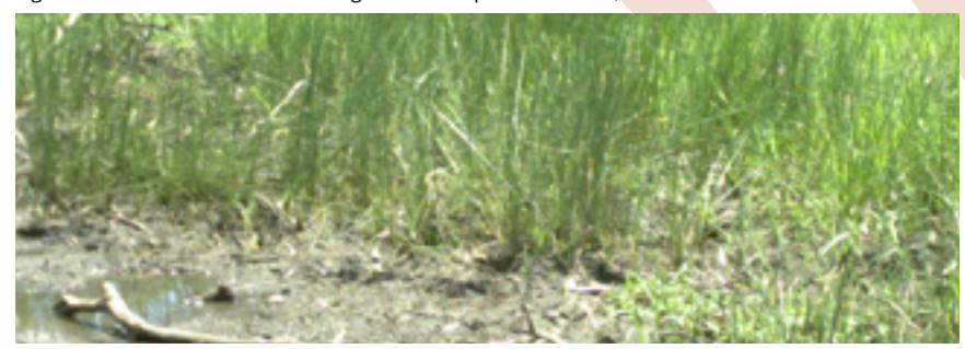
Figure 2: Poor conditions for baiting at the same site a few months later.