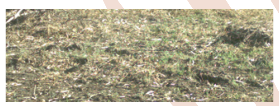
Figure 1: Good conditions for baiting in the Macquarie Marshes, New South Wales.

This field guide mainly focuses on poison baiting, but there are several aspects