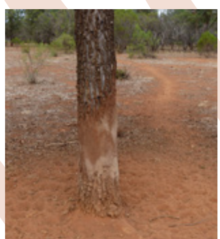
Mud rub marks on a tree