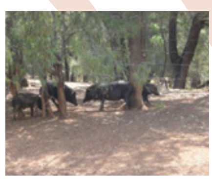
Pigs rubbing against trees