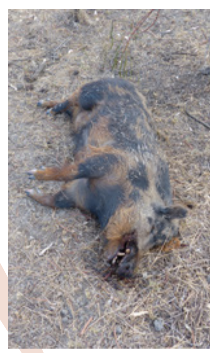
Figure 11: Large boar found dead after feral pig baiting program.

Feral pig dung is commonly found along warn travel-pads and at high use areas. Dung may vary in appearance according to their diet, and dung can last in the environment for many months depending on the environmental conditions.