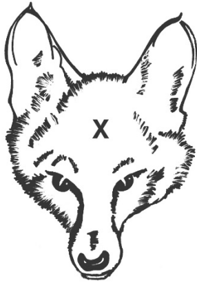
Head shot (frontal)